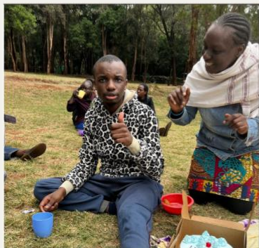
Family Fun Day