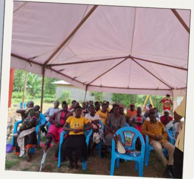
Community Awareness Events